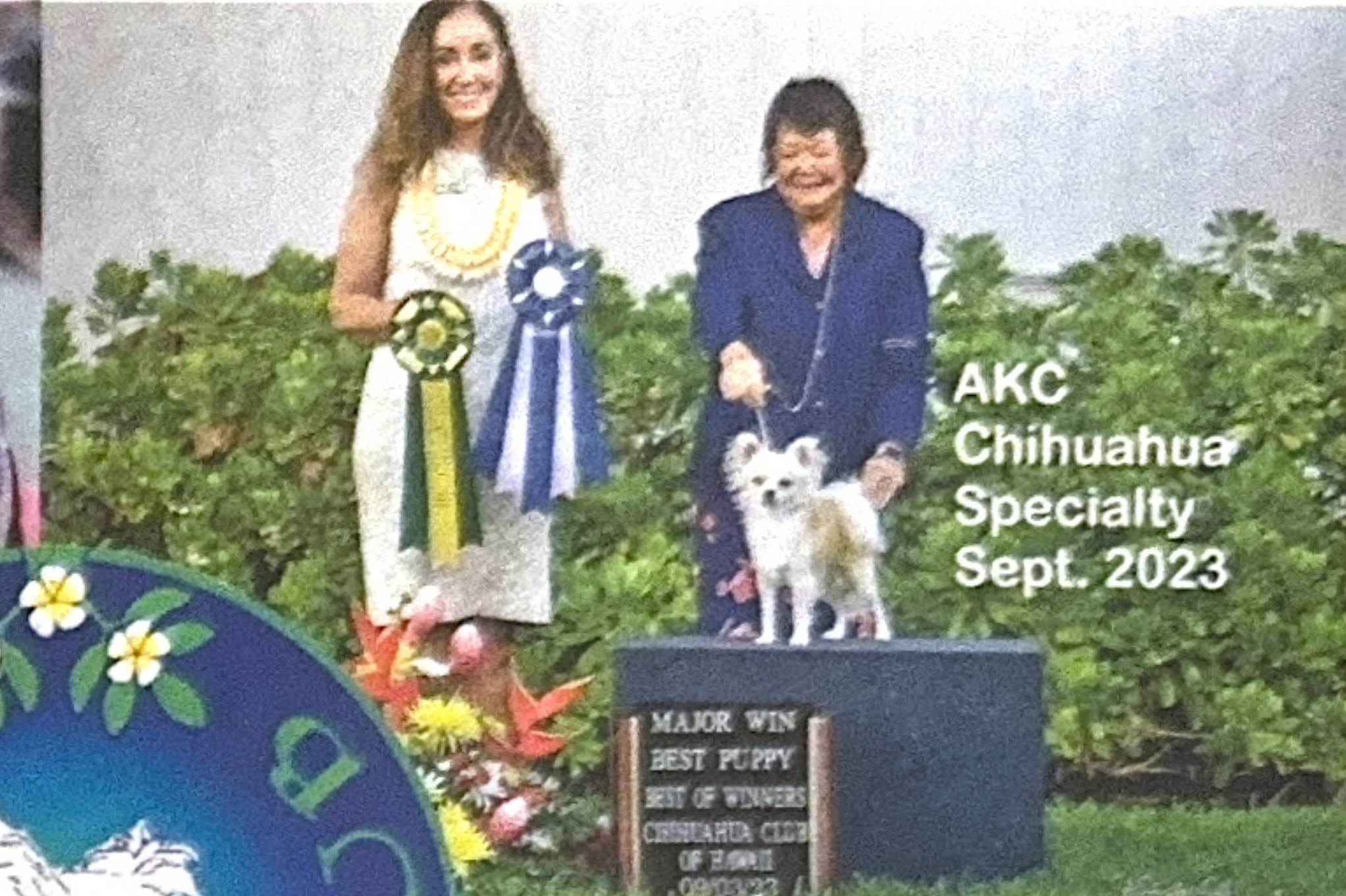
AKC Chihuahua Specialty Sept. 2023