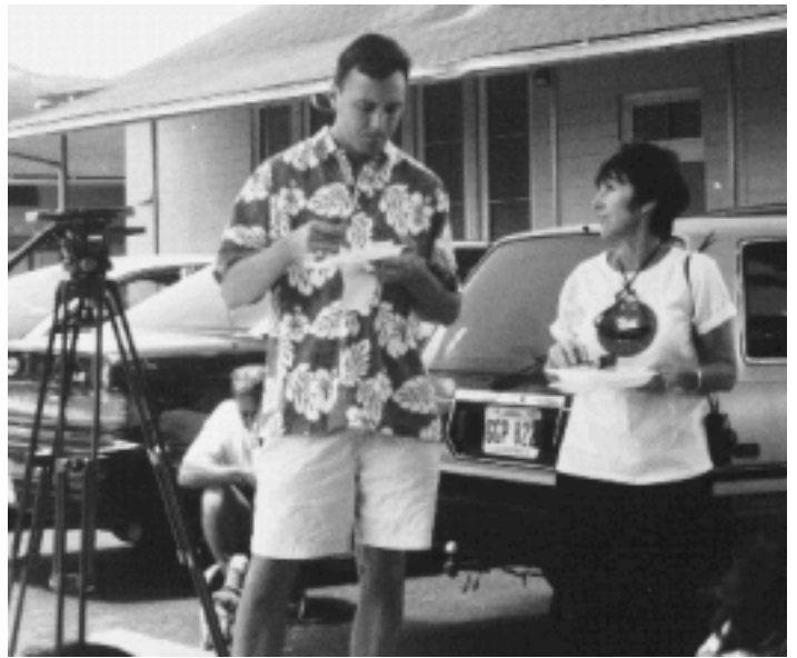
Reporter at the Chihuahua Olympics