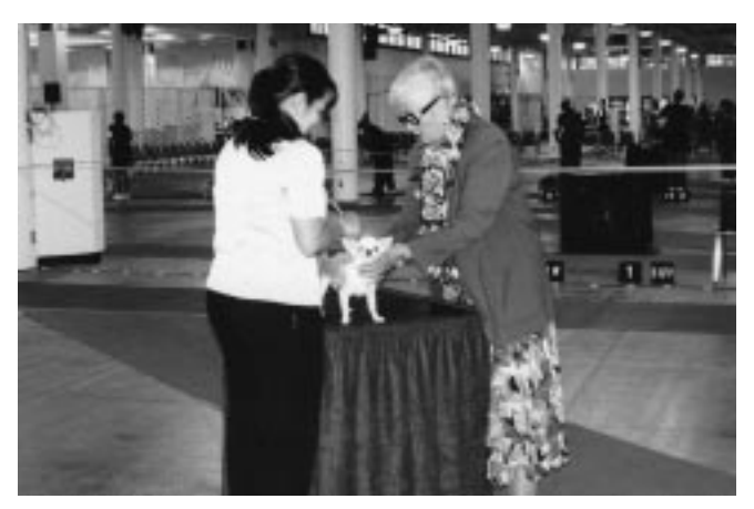
Hawaiian Kennel Club Show, September 2001