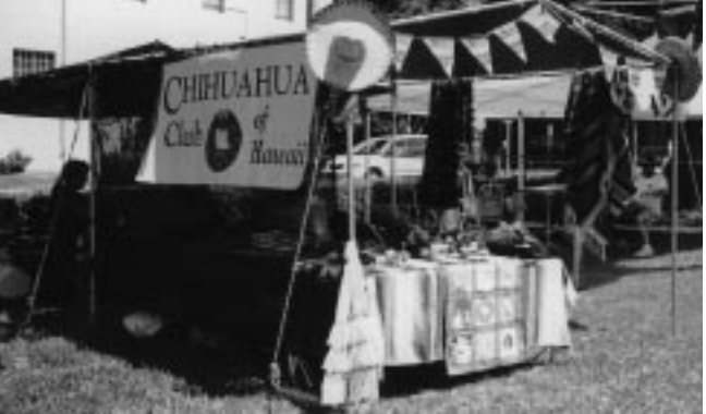
CELEBRATION OF DOGS 2001 - Aye Carumba!