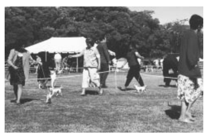
West Oahu Show, August 2001

Are you interested in showing? Call or email us. You do not even need a dog to show. You could help out at the show and practice showing to see if you like it before you actually get a show quality Chihuahua.