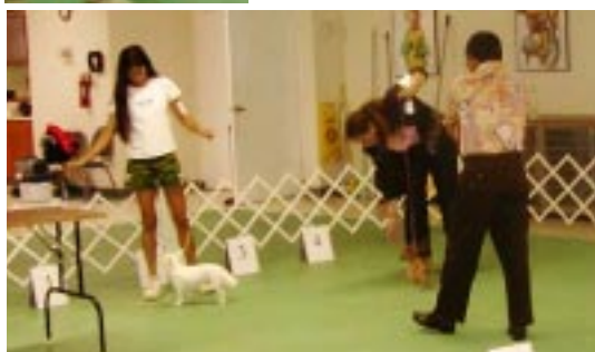
◀ Best of Breeds compete for Best in Match