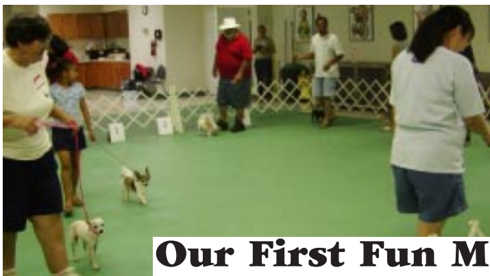
Our First Fun Match

Memorials for a beloved Chihuahua will also be available. When the Club is notified, the Club will make a donation in your Chihuahuas memory to the Club's CARE fund (rescue fund), and a notice will be published in our newsletter. A Memorial, including a picture for a member's beloved Chihuahua, will be at no cost.