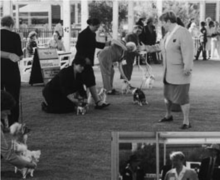
Dogs in the ring