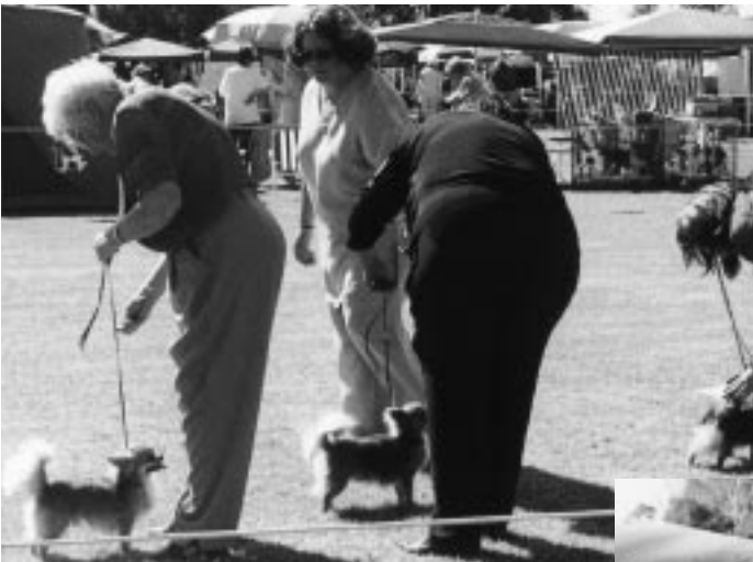
Dogs being judged