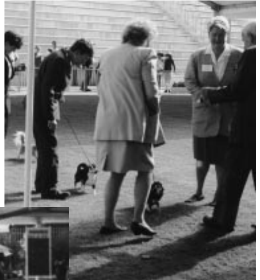
Winners wait for ribbons