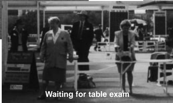
Waiting for table exam